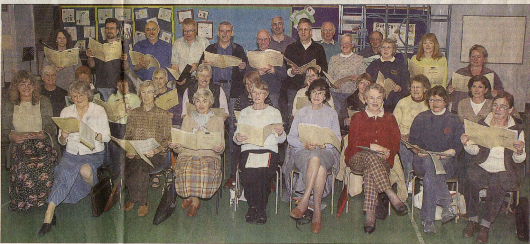
■ Still going strong: The Hexham Orpheus Choir are looking forward to another 50 years of music-making. Photo: D160501